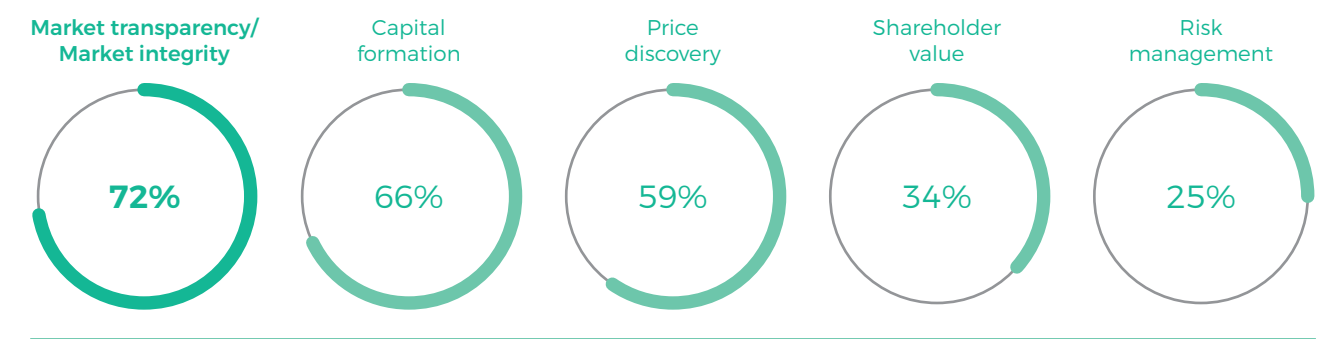
Exhibit 3: Top social benefits generated by MIs, as perceived by market participants (Percent selected as a top-3 benefit)

Regulations and guidance such as the CPMI-IOSCO Principles for Financial Market Infrastructures (and, in the EU, CSDR, and MiFID II/MIFIR) aim to strengthen risk management capabilities and governance, while other